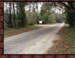
Old Brick Road