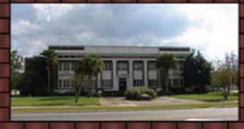
Flagler County Courthouse

P.O. Box 1113 Bunnell Florida, 32110 386-439-1646