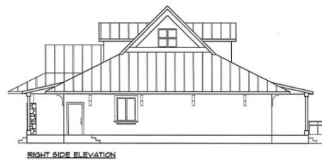
Flagler County North-Side Visitor's Center